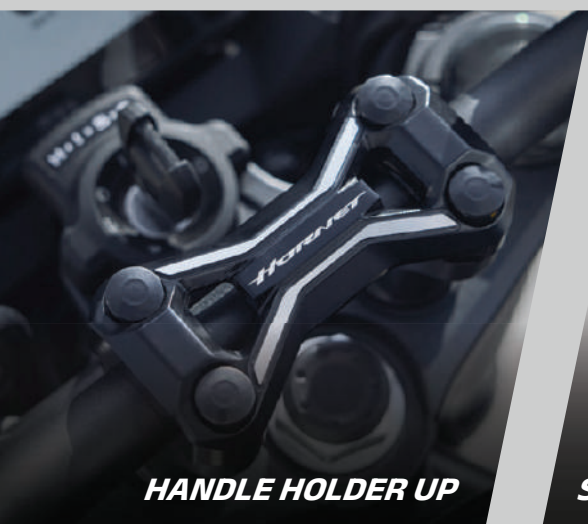
HANDLE HOLDER UP