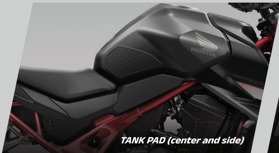
TANK PAD (center and side)