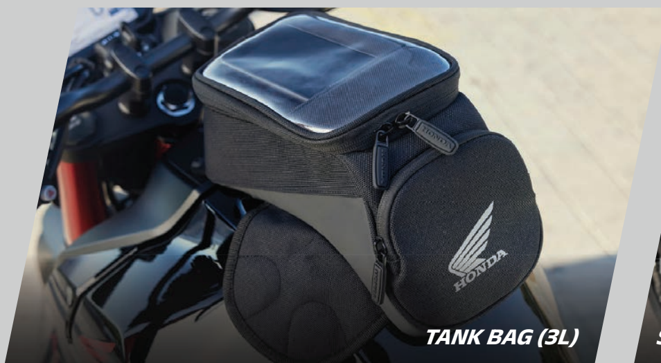
TANK BAG (3L)