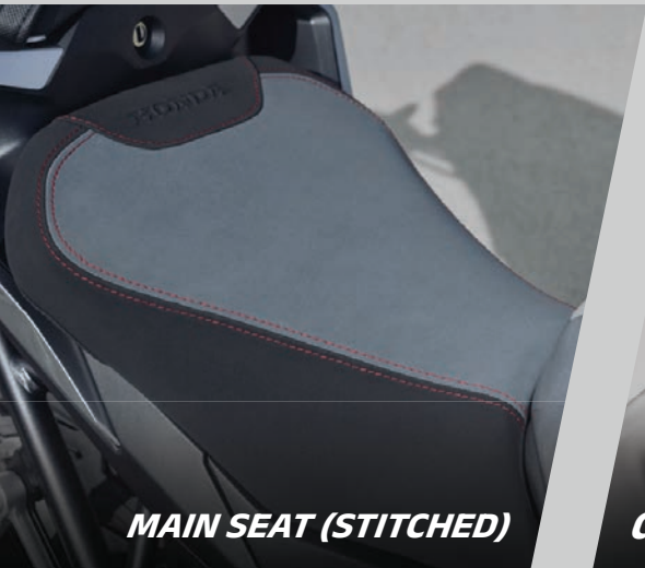
MAIN SEAT (STITCHED)